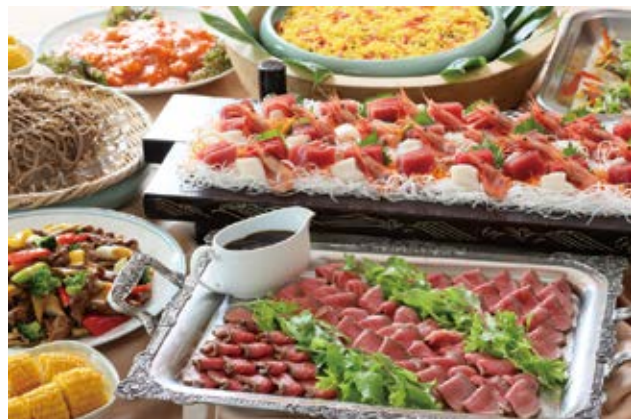
Feast on fresh local foods