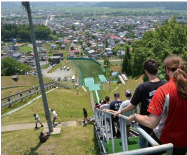
A tour of the ski jump sites