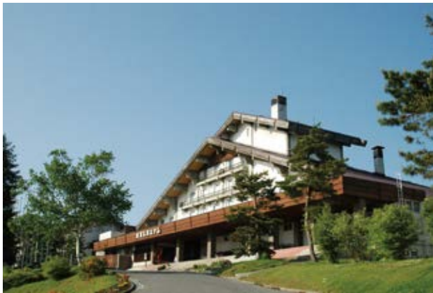
The cozy Madarao Kogen Hotel, surrounded by nature

Madarao Kogen offers a tremendous variety of accommodation for guests, boasting nearly 50 pensions and hotels each with individual character. Facilities can be largely classified into two types: pensions and small boutique hotels that are family-run businesses accommodating up to 30–50 people; and large hotels that can sleep 100–300 guests. Guests can select rooms that are Western style, Japanese style, or even a fusion of both. Meals available also reflect the diversity and characteristics of each particular facility.