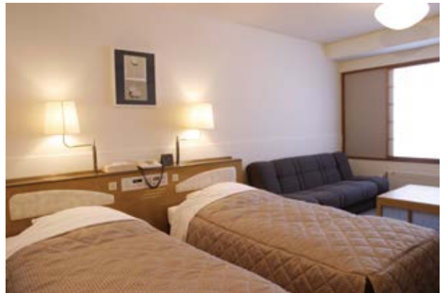
Comfortable Western-style hotel rooms