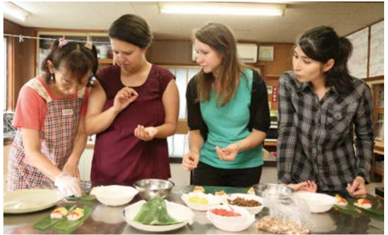
Preparing sasazushi (sushi wrapped in a bamboo leaf), a local delicacy