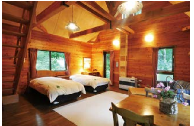
Experience the woods from inside the cottage