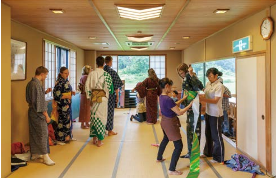
Getting a kimono makeover