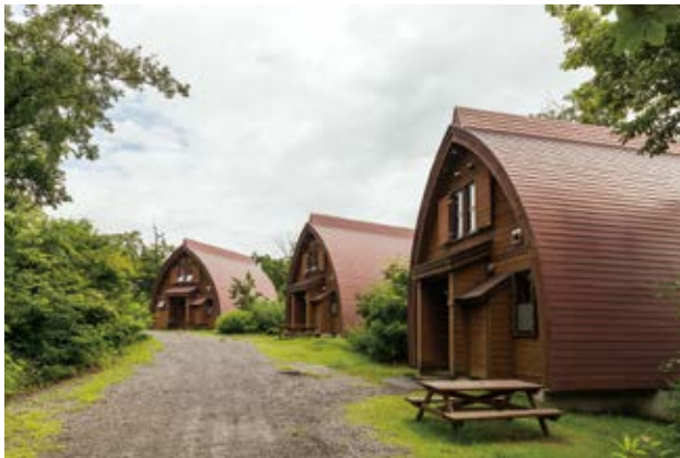
A private cottage that gives a sense of relaxation

Mori-no-ie has 10 cottages for guests, each of which can accommodate 5–7 people. It is located next to a beautiful beech forest. There are three types of cottage available: western style with western beds, Japanese style with tatami matting and a kotatsu (a special heated table for use in winter), and rustic. Each cottage has a loft with Japanese futon and is fully equipped with a wide range of cooking supplies, tableware, a refrigerator, and a microwave.