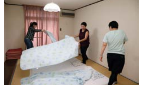
Putting out futon