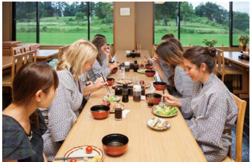
Lunch time; modifications can be made for those with allergies or religious dietary restrictions