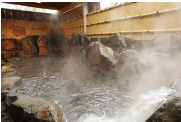
Refreshing Japanese hot spring in a hotel