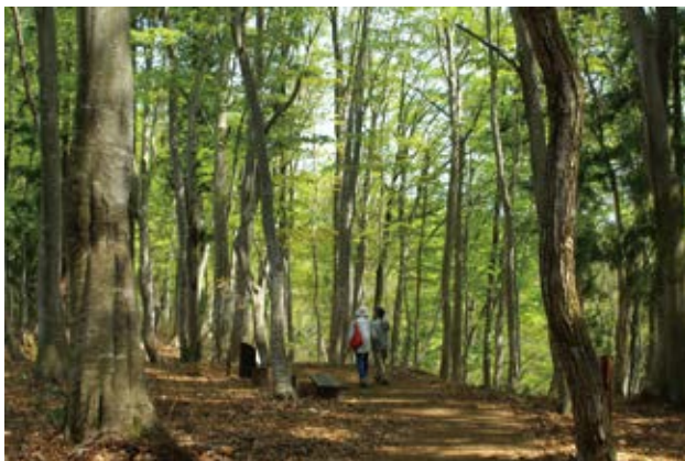
Stroll through a beautiful beech forest