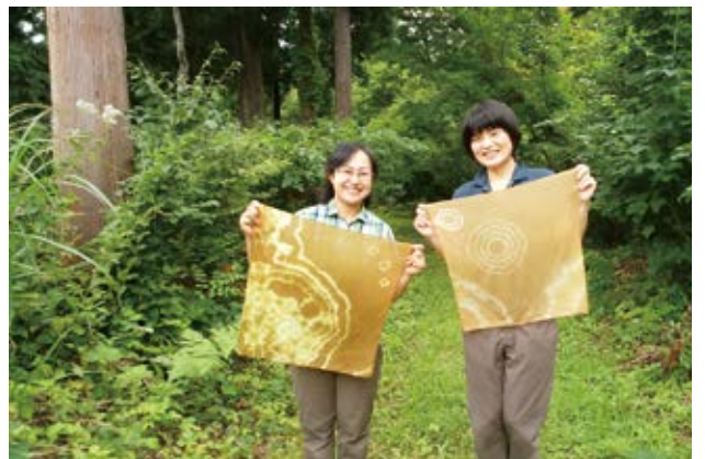
Enjoy a wide variety of fun activities, such as crafts