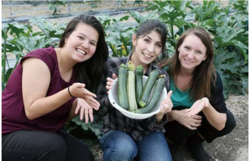
Harvesting fresh vegetables in the garden of a minshuku

We have an extensive range of programs that offer a wide variety of experiences, from sports activities to hands-on farming.